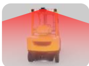
Rear Camera 210°