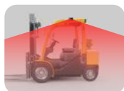
Left Side Camera 210°