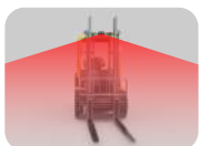
Front Camera 210°