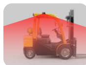
Right Side Camera 210°